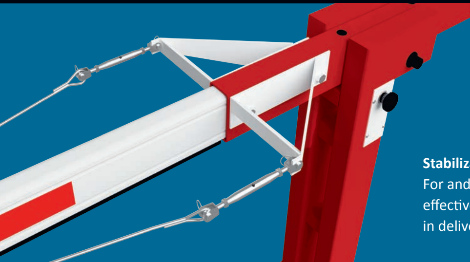
Stabilization rope For and up EH 55L (5,500mm effective boom length) included in delivery

*For and up EH 40L (4,000mm effective boom length) a swinging support or a fixed support is mandatory