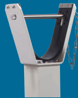
Stainless steel bolt at the fixed support , installed, for padlock (on site)