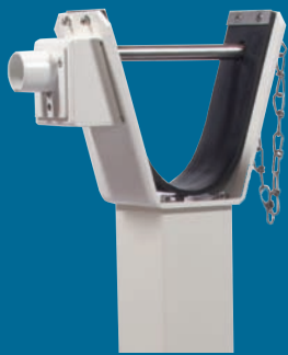
Fire emergency release at the fixed support , installed (optional)