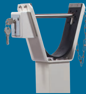
Profile cylinder lock at the fixed support (optional)