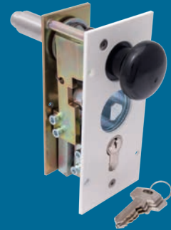
Locking device 3 and 4* Fire emergency release and profile cylinder lock at the barrier stand (optional)