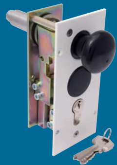
Locking device 1 and 2* Profile cylinder lock installed at the barrier stand (optional)