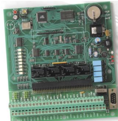
Access control board, 4 input